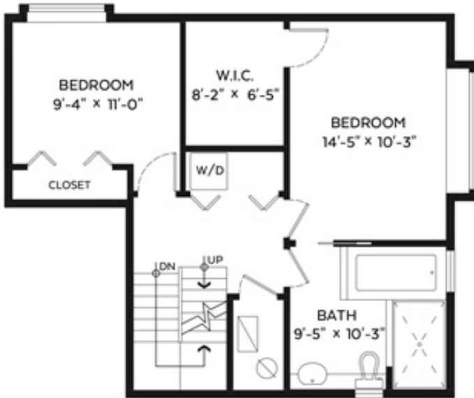
Upper Floor Plan Floor Area: 646 sq.ft.