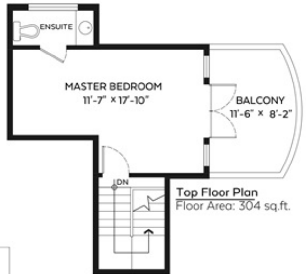
Top Floor Plan Floor Area: 304 sq.ft.